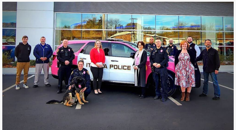
IPBA & Community Members pose with an IPD vehicle wrapped in pink to raise awareness around breast cancer.