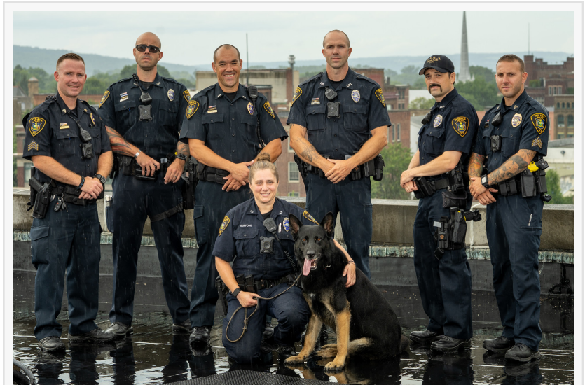
Ithaca Police Officers with K9 Rex.

ITHACA, NEW YORK, UNITED STATES, July 27, 2023 /EINPresswire.com/ -- The Ithaca Police Department is hiring, and the Ithaca Police Benevolent Association, the labor union representing Ithaca's law enforcement professionals, wants everyone to know. Anyone interested can begin the application process at www.ipd-recruit.com . The deadline to apply is August 7th, 2023 at 4:30 PM. There is no residency requirement to take the exam.