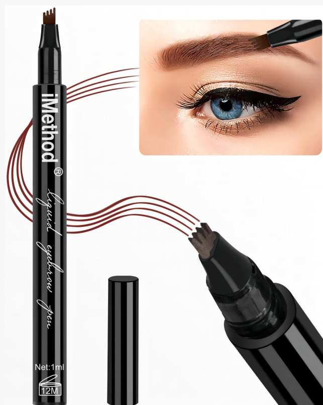
iMethod Eyebrow Pencil, $13.97

This press release can be viewed online at: https://www.einpresswire.com/article/646472630