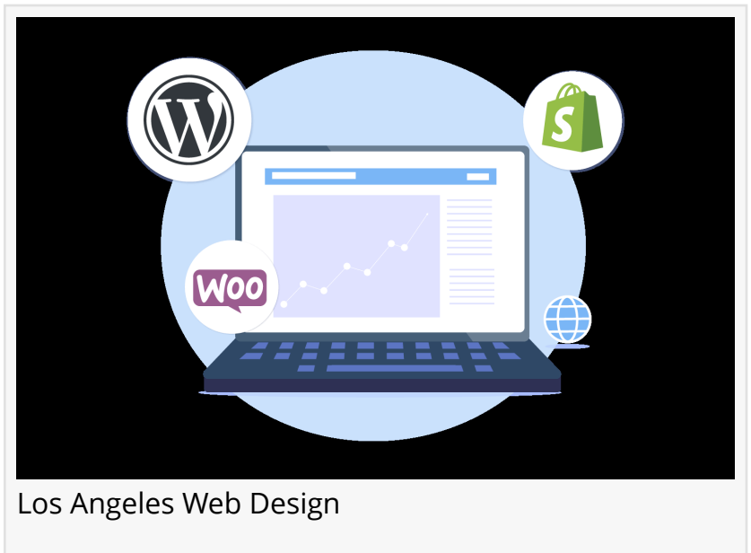
Los Angeles Web Design

Search Engine Optimization (SEO) is the backbone of any online strategy for digital success. In a world where billions of searches are conducted daily, businesses that rank high in search engine results have a significant advantage. Mad Mind Studios recognizes the power of SEO and leverages it to position businesses at the forefront of search engine rankings with the goal of ranking #1 on Google in Los Angeles.