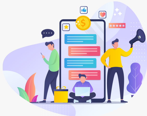
Website Design and SEO