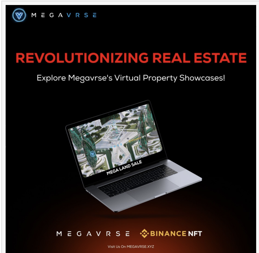
Mega Land Sale

In an unprecedented move that's set to redefine the metaverse landscape, Megaverse , a leading innovator in the metaverse ecosystem, has announced its pioneering inaugural land sale . This sale, offering 9,999 unique land parcels, will be held exclusively on the Binance NFT platform. This venture is not just a land sale; it's a bold step towards expanding the metaverse frontier, providing early adopters with unparalleled benefits and opportunities.