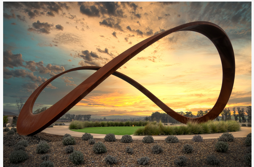
Infinity - by Gordon Huether | Stanly Ranch, Napa, CA

Instructions for selecting favorites is simple: "Vote for as many projects as you'd like, but you are only allowed to vote once per project. Final tallies for votes will be audited at the close of the competition Monday, July 31 at 11:59 pm Central/9:59pm Pacific."