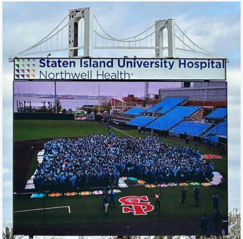
Largest Human Puzzle Piece Event