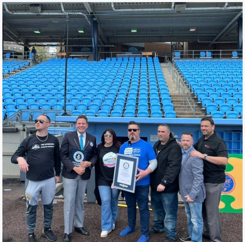
Largest Human Puzzle Piece Event Committee