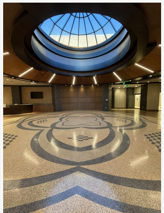
Traditional basketry patterns inspired the award-winning terrazzo floors installed in the Agua Caliente Resort Casino & Cultural Museum.

The NTMA, a 148-member, full-service nonprofit trade association headquartered in Fredericksburg, Texas, celebrates its centennial this year. The NTMA establishes national standards for terrazzo systems for floor and vertical applications. Its mission is to promote quality craftsmanship and creativity in terrazzo while supporting its members in their trade and service to the construction industry.