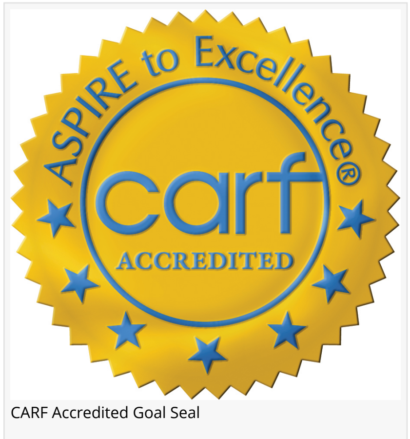
CARF Accredited Goal Seal

This press release can be viewed online at: https://www.einpresswire.com/article/646586491