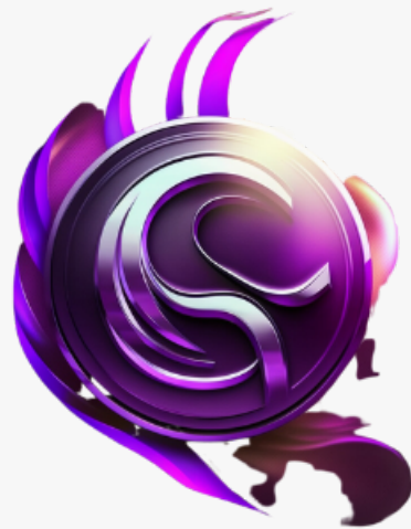
Uvitu's Fashion Jewelry Collection

NEW YORK, NY, UNITED STATES, July 30, 2023 /EINPresswire.com/ -- Uvitu, a leading international ecommerce platform, invites jewelry enthusiasts to explore and embrace their unique sense of style with their fashion jewelry collection . Positioned as a trendsetter in the industry, Uvitu is redefining the world of jewelry, offering a diverse range of versatile fashion accessories that transcend boundaries. From necklaces and earrings to bracelets, watches, and rings, Uvitu presents a carefully curated selection of statement pieces, catering to both men and women, empowering individuals to express their creativity and make bold fashion choices.