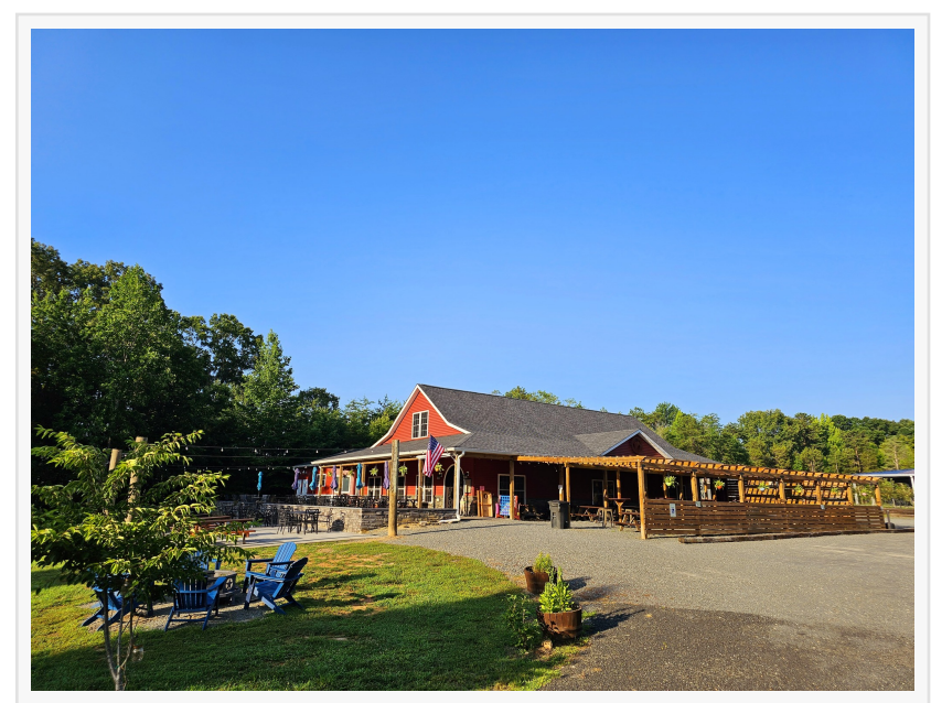
Mineral Brewing & Coyote Hole Tasting Room

Coyote Hole Craft Beverages is a wellestablished family and veteran owned craft beverage manufacturer known for its dedication to crafting exceptional hard ciders and beer that cater to a wide range of palates. With a strong