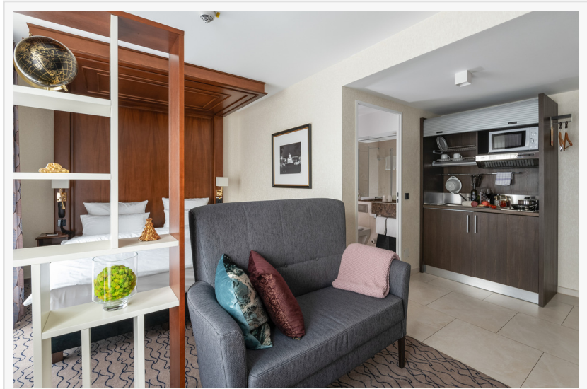
Another view of one of our apartments perfect for mid to long-stays