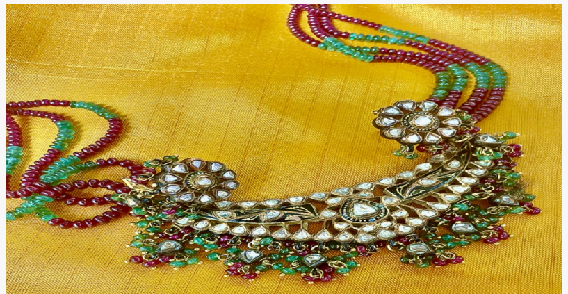
Polki Jewellery in Jaipur