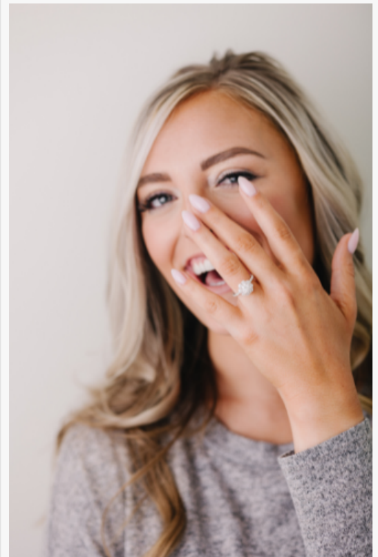
Luvari Custom Jewelry

Luvari stands out in the industry through its continuous integration of technology and innovation into the production process. This technological edge results in exceptional quality, better pricing, and faster lead times for customers.