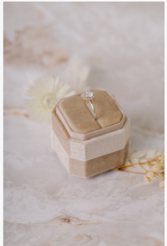
Luvari Engagement Ring