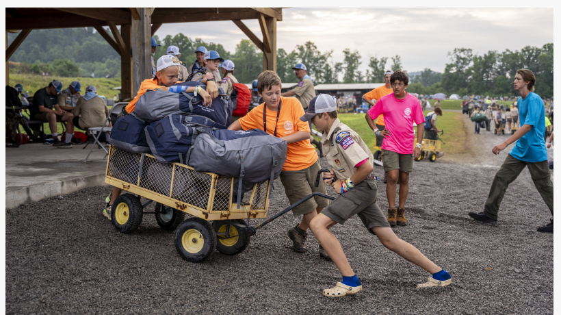
Scouts breaking down camp and getting ready to head home during the 2023 National Scout Jamboree at The Summit Bechtel Reserve in Mount Hope, West Virginia.

MOUNT HOPE, VA, UNITED STATES, July 31, 2023 /EINPresswire.com/ -- As nearly 16,000 Scouts and Scouters pack their gear, roll up their tents, and board busses to head back to their home states and countries, they'll be taking with them memories and friendships that will last a lifetime. Over the past 10 days, they've had the opportunity to learn new skills, participate in high adventure activities, gain insights into different points of view, and to have a boatload of fun.