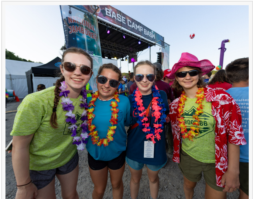
Scouts get ready for fun during the 2023 National Scout Jamboree Basecamp Bash, at The Summit Bechtel Reserve in Mount Hope, West Virginia.