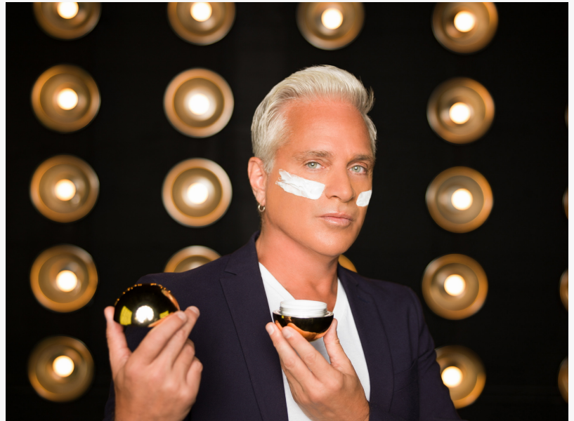
TheKemptMan man organic

This press release can be viewed online at: https://www.einpresswire.com/article/647260403 EIN Presswire's priority is source transparency. We do not allow opaque clients, and our editors try to be careful about weeding out false and misleading content. As a user, if you see something we have missed, please do bring it to our attention. Your help is welcome. EIN Presswire,