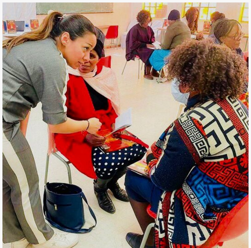
Dianetics Seminar presented to the Widows Club in the Vaal, South Africa.

The word Dianetics comes from dia, the Greek word for "through," and nous, Greek for "mind" or "soul." It is most accurately described as what the soul is doing to the body through the mind.