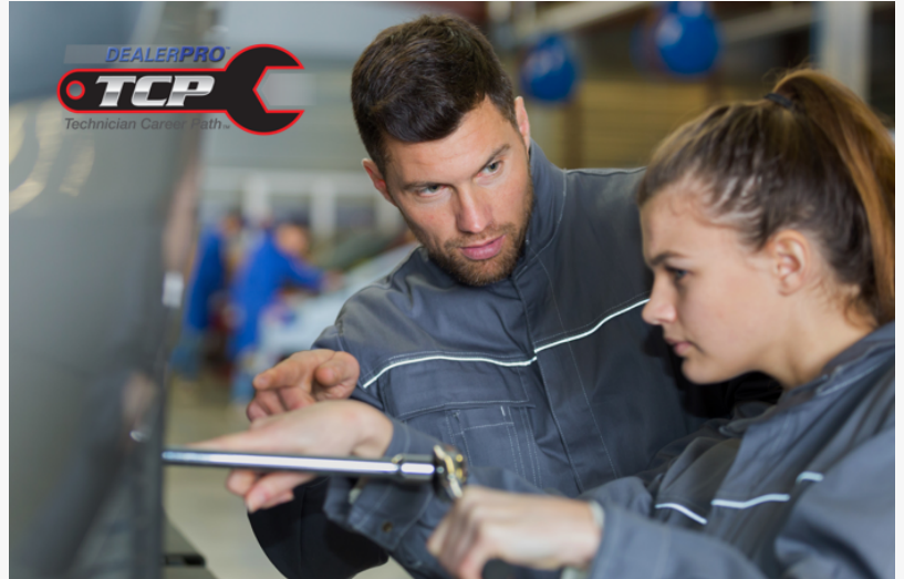
Technician Career Path Training