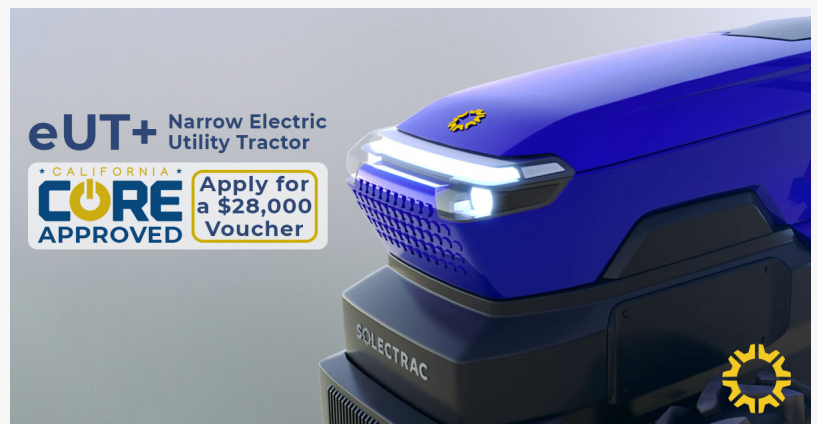
Solectrac eUT+ Narrow Electric Utility Tractor: California CORE Approved