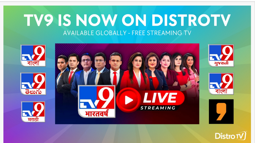
TV9 is Now on DistroTV