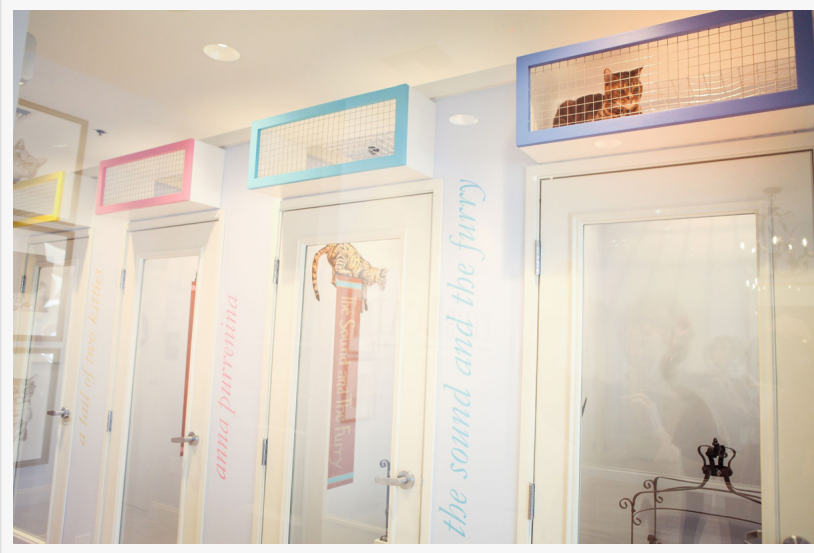
Club Cat kitty cat guest relaxing in his private balcony

Fashioned after luxury hotels and resorts, Club Cat's unique accommodations are a departure from traditional boarding options for cats. In addition to modern trompe l'oeil and