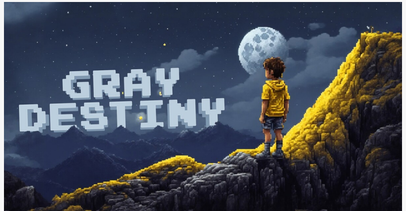
Gray Destiny Cover