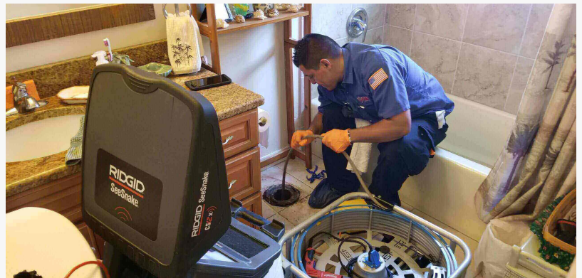
Concrete Dissolver Chemical