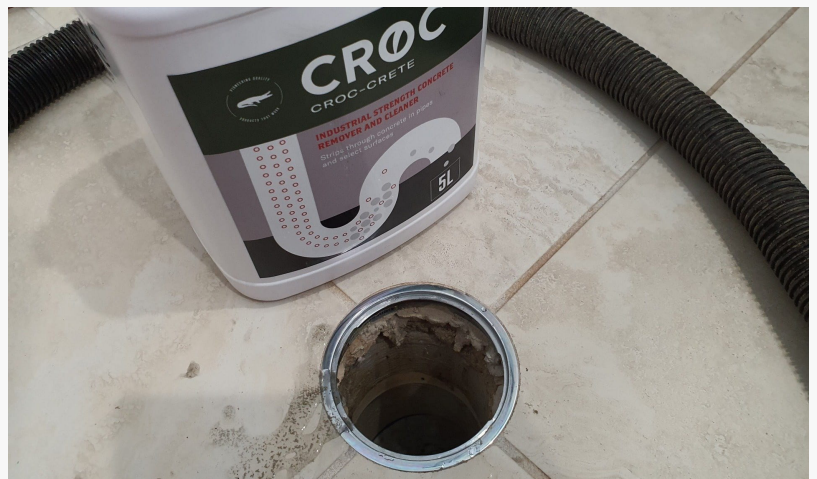
Premier Concrete Dissolver

Cost Savings: The cost-effectiveness of this concrete dissolving chemical translates into substantial savings on labor, machinery, and replacement parts, driving a positive impact on the