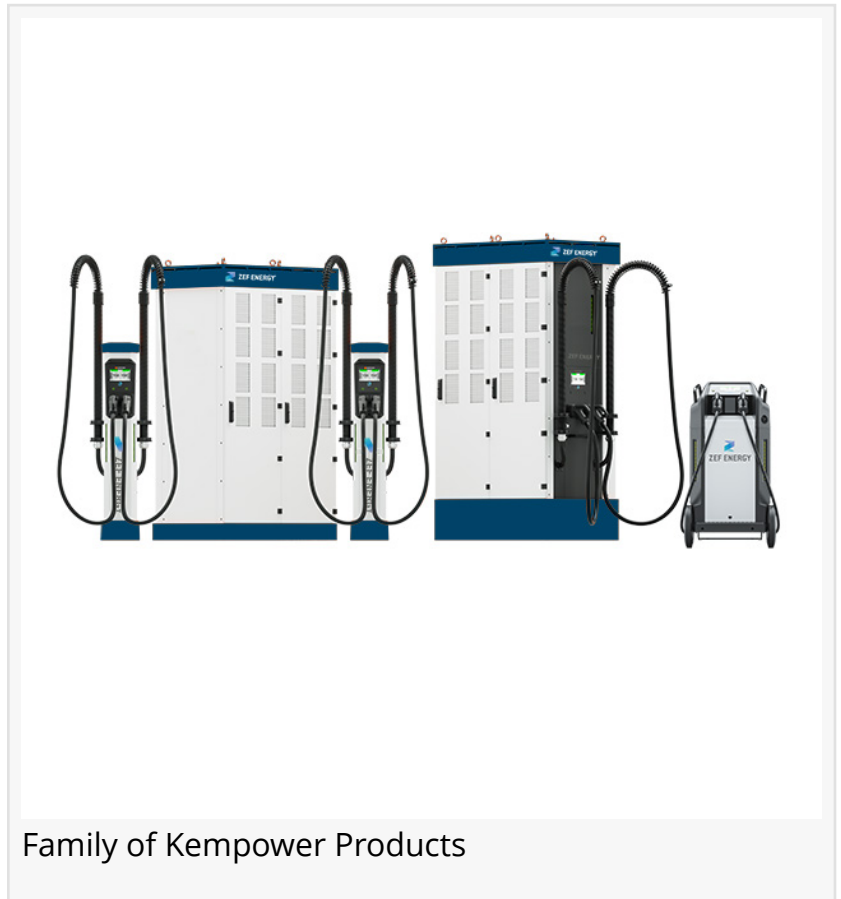
Family of Kempower Products

MINNEAPOLIS, MN, UNITED STATES, August 1, 2023 /EINPresswire.com/ -- ZEF Energy , an industry-leading electric vehicle (EV) charging software and hardware provider, today announced a new partnership with Power Midwest , a national Level 2 and DC Fast Charger distributor. This partnership agreement centers on the stocking of ZEF Energy DCFCs powered by Kempower , which makes Power Midwest the first distributor of Kempower products in North America.