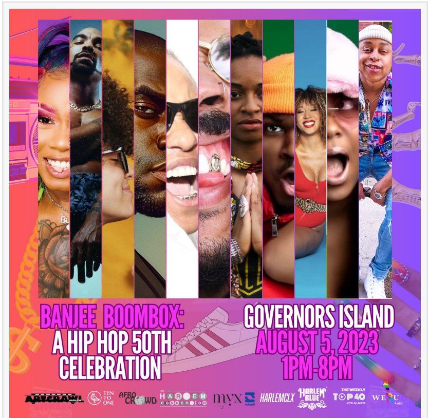
Banjee Boombox | ArtCrawl Harlem v1

Banjee Boombox is made possible through the generous support of sponsors including AfroCROWD, The Harlem Connection (WBAI), HalemCLX, Chong's Laboratory, Ten to One Rum,