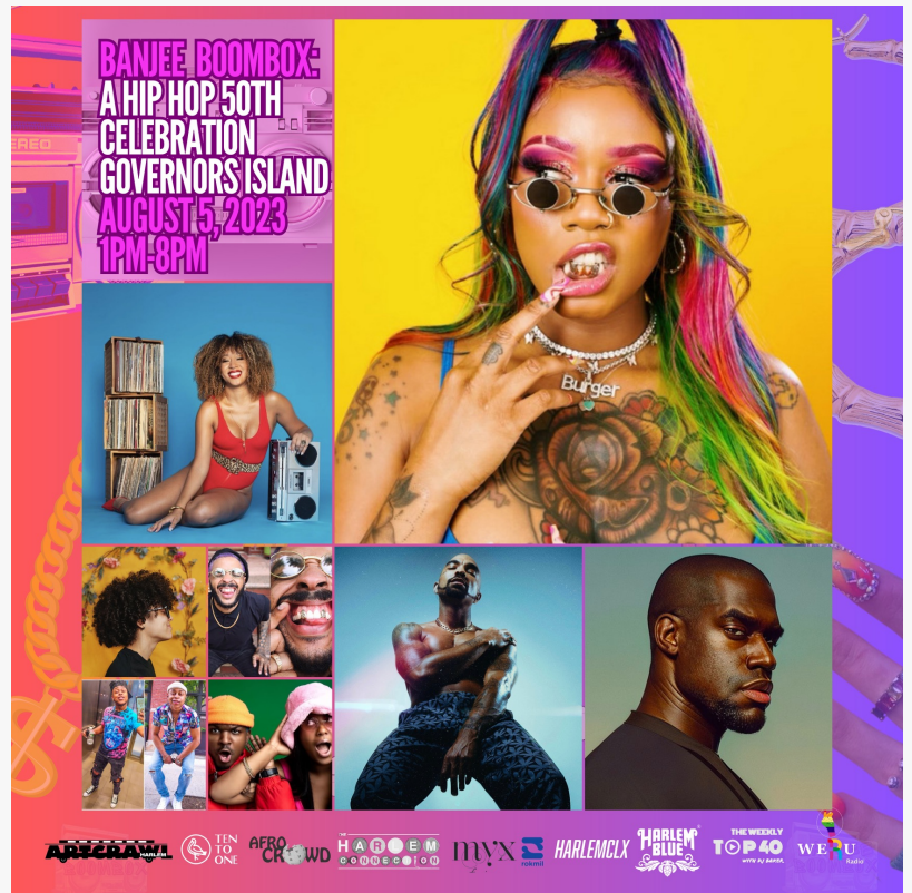
Banjee Boombox | ArtCrawl Harlem v2