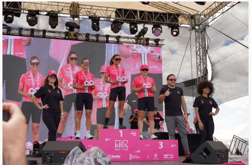
More than two thousand cyclists, including both professionals and amateurs and lovers of this sport were able to enjoy the ride, divided into three routes