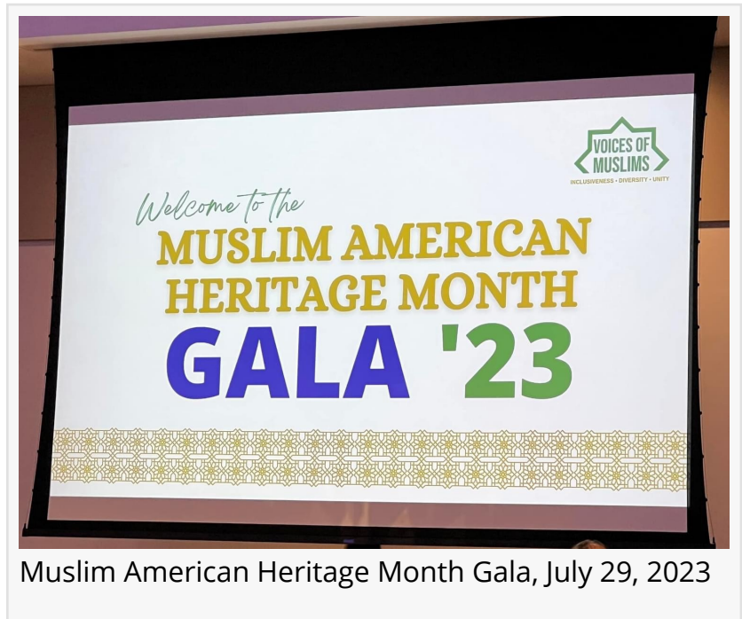
Muslim American Heritage Month Gala, July 29, 2023

ATLANTA, GA, UNITED STATES, August 1, 2023 /EINPresswire.com/ -- Voices of Muslims (VoM) worked with legislature on both sides of the aisles to introduce Georgia House Bill 360 recognizing Muslim's contributions to Georgia, USA, and the world. VoM worked with mayors, city council members of 30 cities and commissioners of 6 counties across Georgia organizing proclamation presentation ceremonies with participation of Muslims and Non-Muslims. For the first time in the history of America, VoM brought 100's of people from all faiths under one roof celebrating and recognizing July as "Muslim American Heritage Month".