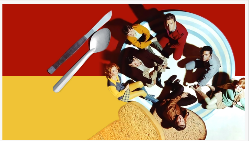
Land of the Giants TV show cast members gathered on a dinner plate next to giant knife and spoon

To download images visit: https://drive.google.com/drive/u/0/folders/16-jPY_yLJ5mrHqT6oyb-5B9o6V80ENjr