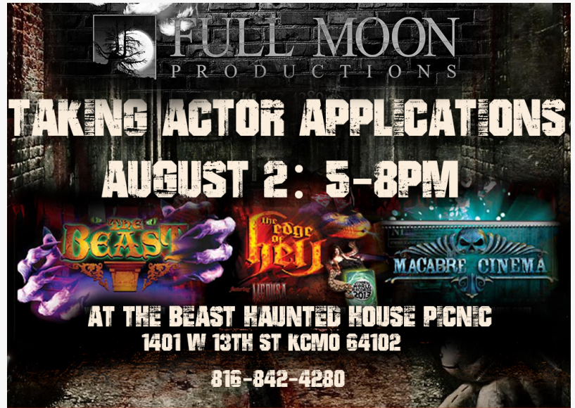
Haunt Hiring Picnic August 2 in Kansas City's Beast Haunted Attraction

KANSAS CITY, MO, UNITED STATES, August 2, 2023 /EINPresswire.com/ -- Fear and excitement generated at a hiring fair are common emotions among job seekers. These emotions go full tilt at the hiring picnic of the scare-entertainment professionals at Beast , Edge of Hell , and Macabre Cinema . The picnic will be held at the Beast Wednesday, August 2, from 5-8pm. Kansas City's Edge of Hell is the oldest operating commercial haunted house in America – keeping the tradition of going to haunted attractions for 49 seasons.