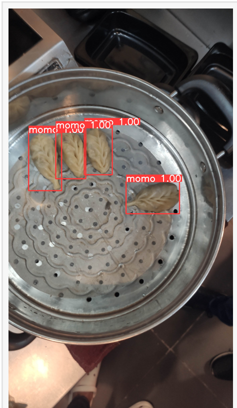
Food item and recipe monitoring done through Artificial Intelligence by Factacy Ai

This press release can be viewed online at: https://www.einpresswire.com/article/647718603