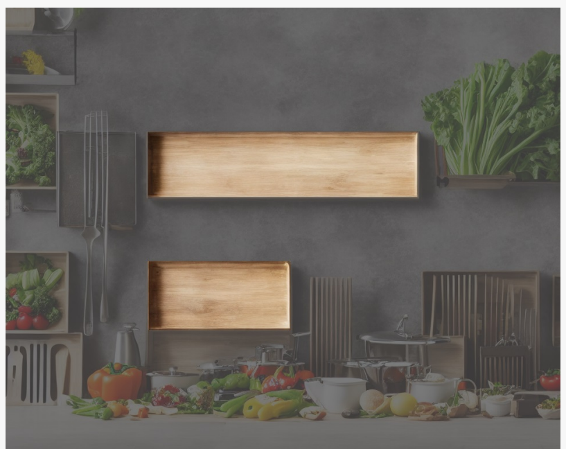
Factacy, Ai as A Service Company helping brands adopt Ai and increase ROI

Factacy's AI-based solutions are designed to adapt seamlessly to the specific needs of businesses, and their collaboration with BluePine Foods exemplifies this approach. By harnessing the power of AI, BluePine Foods aims to streamline its operations, optimize production workflows, and ensure consistent quality across its product line.