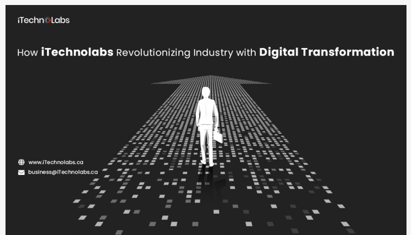
How iTechnolabs Revolutionizing Industry with Digital Transformation

The team of experts at iTechnolabs excels in harnessing a wide array of cutting-edge