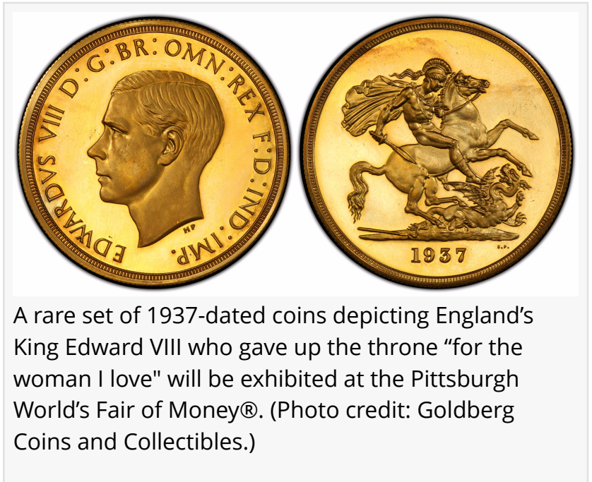
A rare set of 1937-dated coins depicting England's King Edward VIII who gave up the throne "for the woman I love" will be exhibited at the Pittsburgh World's Fair of Money®.