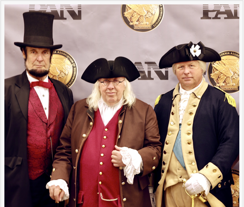
The public can take photos with costumed George Washington, Abraham Lincoln, and Ben Franklin reenactors at the 2023 Pittsburgh World's Fair of Money®, August 8-12.

This press release can be viewed online at: https://www.einpresswire.com/article/647805493