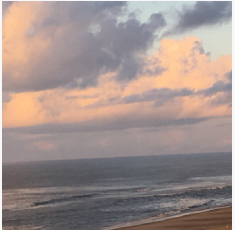
Beach Before Rain