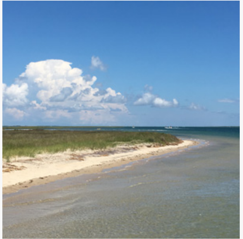
The clouds are almost low enough to touch the water.