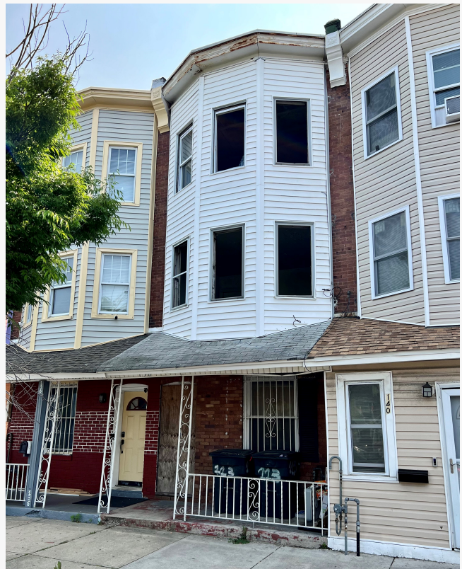
3-Story Home on Pennsylvania Ave