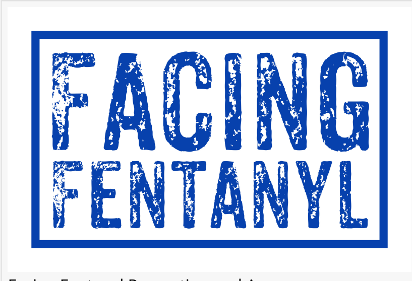
Facing Fentanyl Prevention and Awareness

WASHINGTON D.C., US, August 3, 2023 /EINPresswire.com/ -- Facing Fentanyl (FF) is proud to announce the second annual National Fentanyl Prevention and Awareness Day on August 21, 2023. The Senate unanimously passed a Resolution last week observing the day each year to recognize the dangers related to this drug and remember the lives lost to fentanyl poisoning. As the devastating illicit fentanyl crisis continues to grip our nation, this day serves as a crucial reminder of the