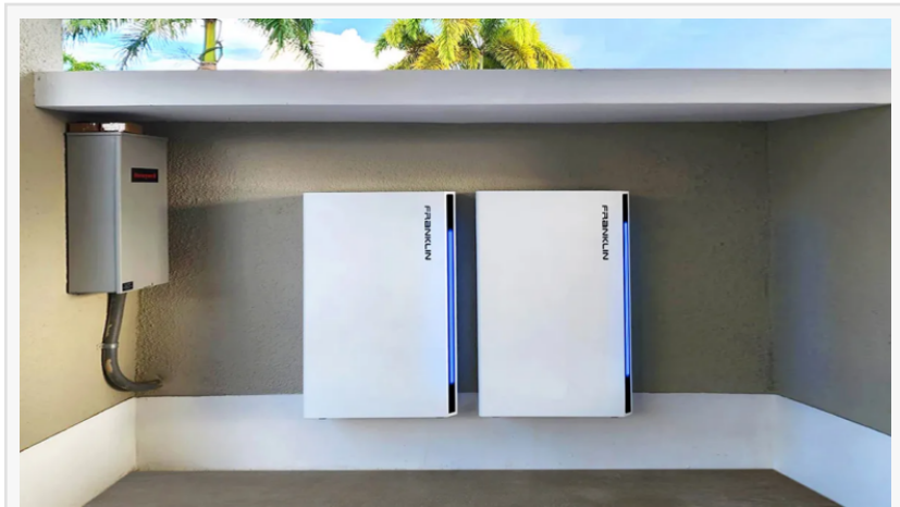
Intelligent Energy Management to Support Household Consumption- FranklinWh Battery

The endorsement of FranklinWH's FHP system by GHS, signifies the company's confidence in the product's reliability, efficiency, and performance. As an established player in the solar game, GHS's stamp of approval adds a layer of assurance for homeowners considering investing in FranklinWH's solution. They can now feel more comfortable and secure in their decision to adopt FranklinWH for their home energy storage needs.