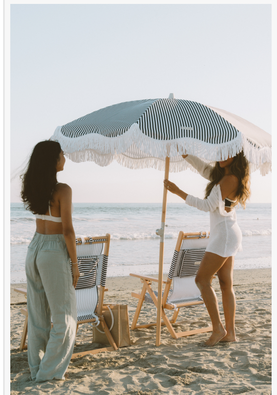
Navy and White Stripes Collection | The Janeiro

For more information, visit www.thejaneiro.com