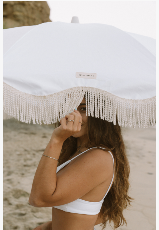
The Janeiro Classy Beach Umbrella Vintage White