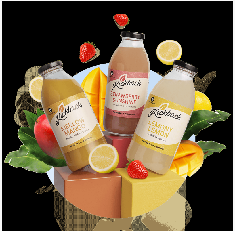
Los Angeles CPG Branding and Web Design