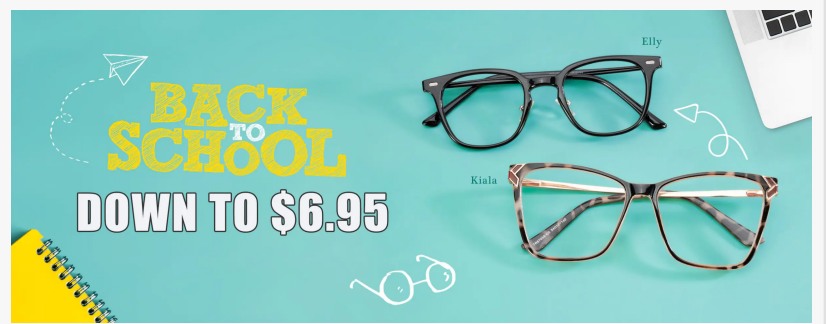
Lensmart Back to School Sale 2023

As an innovative glasses brand, Lensmart always has a keen eye on the fashion trends. In the