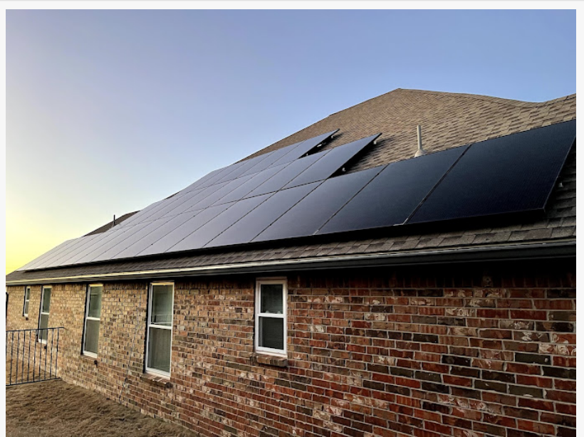
Residential Solar System in Texas

As the interest in solar energy grows, a cohort of proficient solar installers has emerged across Texas to facilitate the transition to solar power. These experts bring a wealth of knowledge and experience to guide homeowners through the intricate process of installing solar panels.