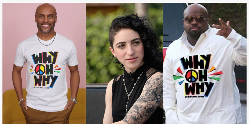
World renowned Music Artists Kenny Lattimore, Emily Estefan and Ceelo Green are featured on the uplifting #bestsongforsocialchange, "Why Oh Why."