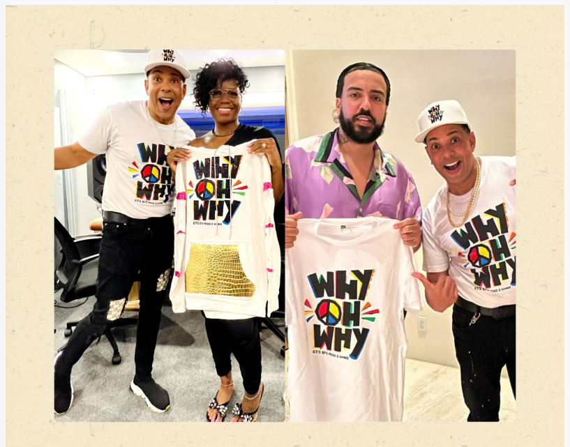
International Music Artists Fantasia and French Montana joins Raffles van Exel's Artists for Global Unity on the new song for social change "Why Oh Why."

This press release can be viewed online at: https://www.einpresswire.com/article/648540477