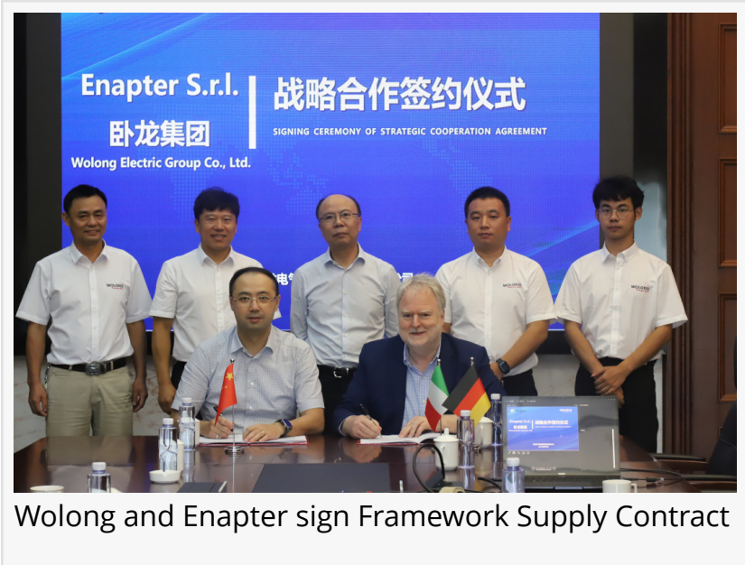
Wolong and Enapter sign Framework Supply Contract

SHANGYU / BERLIN, CHINA / GERMANY, August 7, 2023 /EINPresswire.com/ -- Enapter AG (ISIN: DE000A255G02) has signed a framework supply contract worth more than 6 million Euros with the Chinese company Wolong. Wolong is one of the leading engine and drive manufacturers worldwide and is also active in the area of renewable energy. The company has a history of developing power supplies for electrolysers of various power ranges and also has a long and successful track record in the pump and fan application sector.