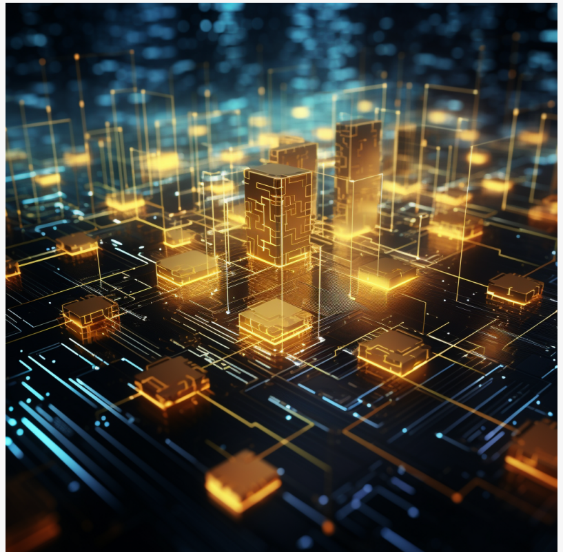
illustration of Blockchain Technology