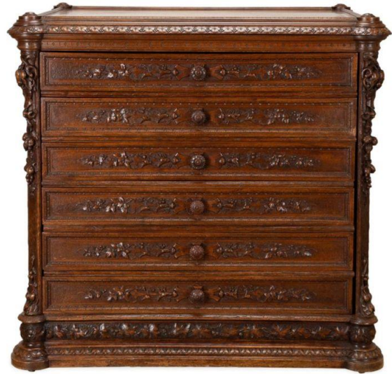
19th century French carved walnut vestment chest in the Renaissance taste with the crown of the House of Bourbon-Two Sicilies, 40 inches tall by 41 ½ inches wide (est. 18,000-$24,000).

Both lots described above will be offered on Day 2, but there are many fine offerings on Day 1 as well, like the stunning Audemars Piguet 18k rose gold and custom diamond set Royal Oak Offshore model watch, case No. 0307, featuring a Swiss made perpetual (self-winding) jeweled movement, custom (non AP) diamond chrono dial, and a custom (non AP) diamond encrusted bezel, case, and bracelet, approximately 15 cts. total of SI-1 clarity and H-I color diamonds (est. $25,000-$45,000).