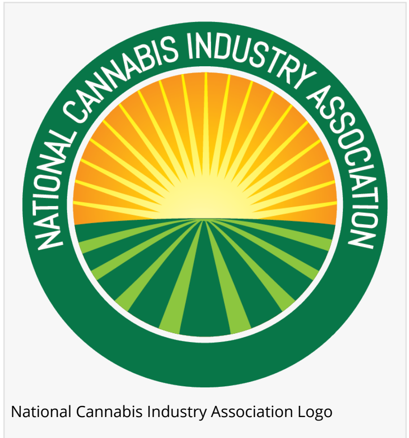
National Cannabis Industry Association Logo