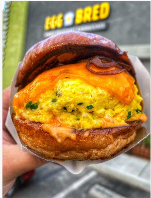
The Scramble Me Softly Is a Crowd Favorite