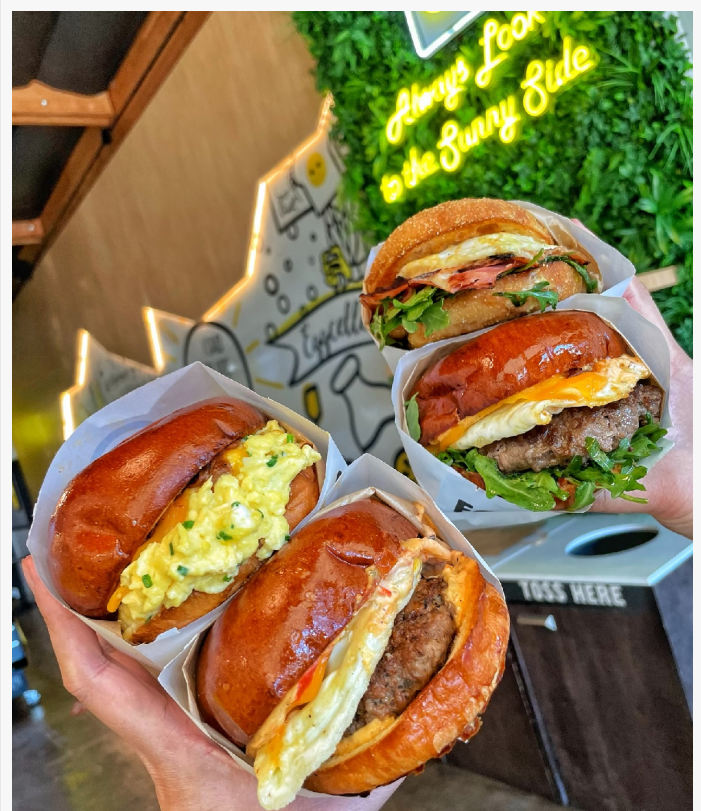
Craft Breakfast Sandwiches