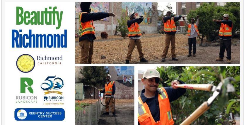
Beautify Richmond Program and Its Partners