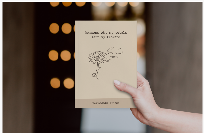
"Reasons why my petals left my florets"