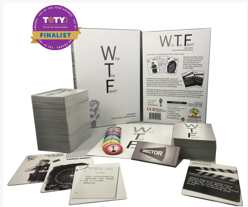
What The Film?! board game contents from Lethal Chicken Games