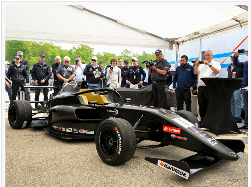
The Ligier JS F422 car is unveiled.

Launched in 2014, FIA Formula 4 was created to offer young racing drivers around the world the