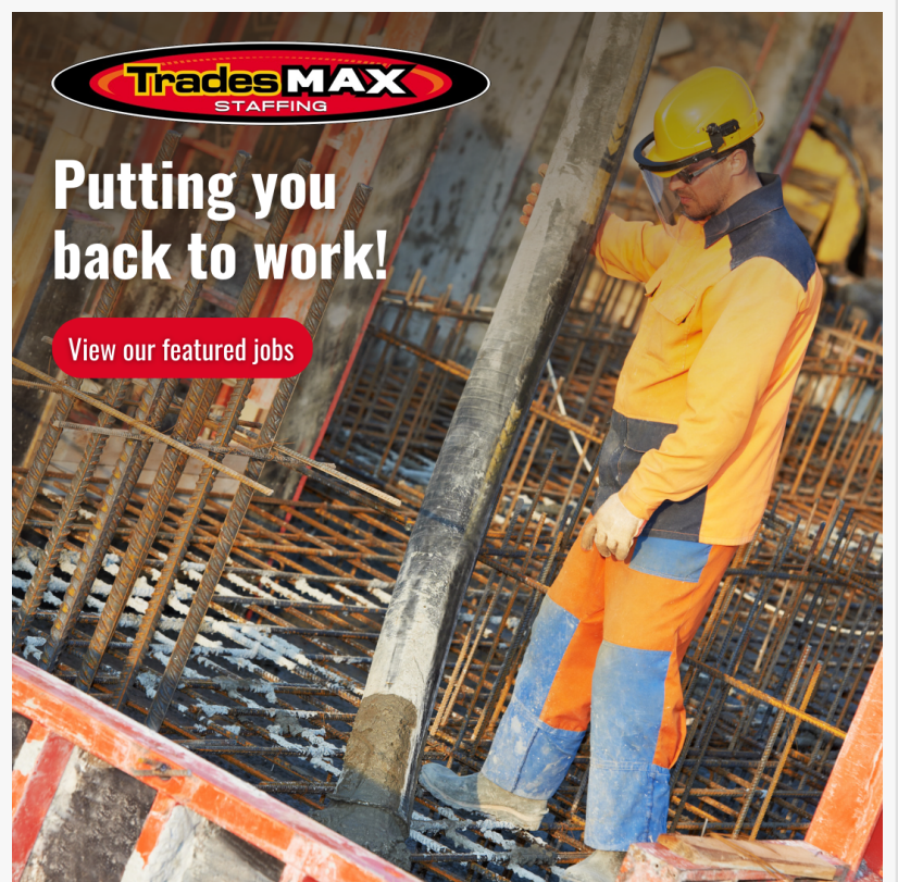
Pensacola Temp Agency